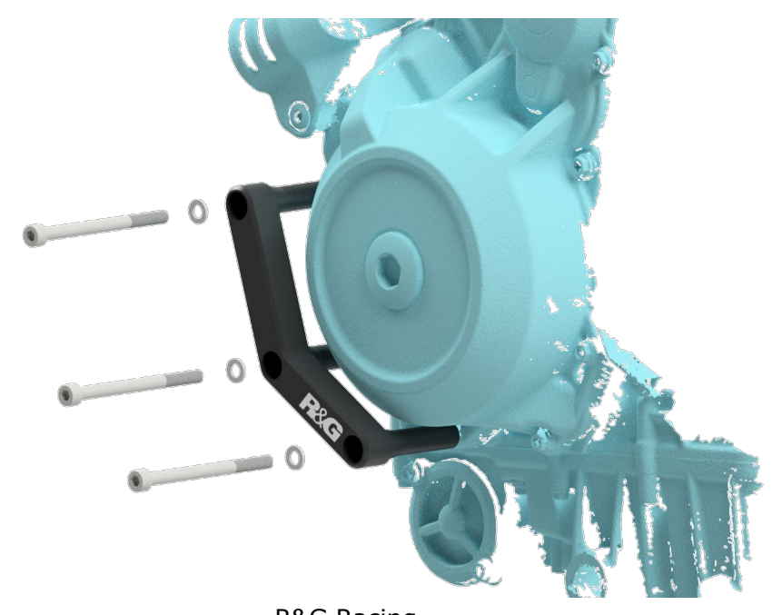
R&G Racing Unit 1, Shelley's Lane, East Worldham, Alton, Hampshire, GU34 3AQ

Tel: +44 (0)1420 89007 Fax: +44 (0)1420 87301 <a href="www.rg-racing.com">www.rg-racing.com</a> Email: <a href="mailto:info@rg-racing.com">info@rg-racing.com</a>