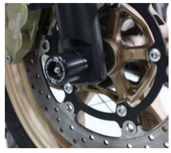
LE KIT CONTIENT LES ARTICLES EXPOSES CI-DESSOUS, VERIFIER QUE TOUTES LES PIECES SOIENT PRESENTES AVANT DE PROCEDER AU MONTAGE.