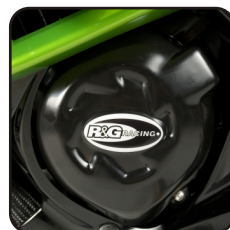
ENGINE CASE COVERS