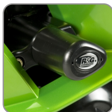
AERO CRASH PROTECTORS