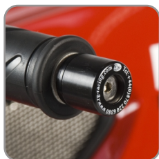
BAR END SLIDERS