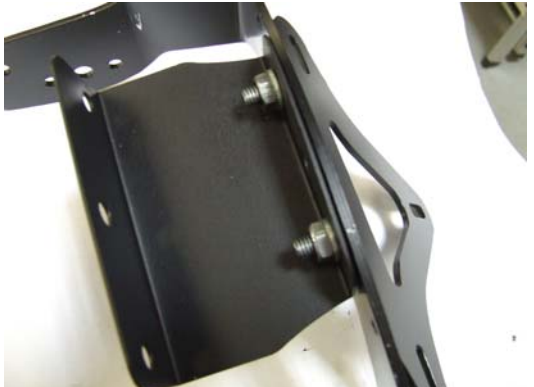
CONNECTING BLOCK IN POSITION